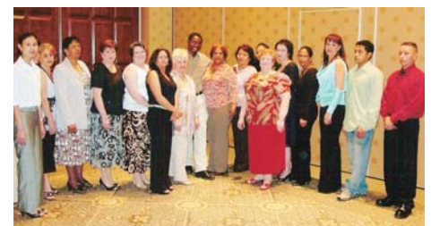
Leadership For a Future 2007 graduates at the Institute's 27th Annual Awards dinner.

Leadership for a Future begins its 2008 schedule with a weekend retreat in February followed by seven Saturday morning sessions through May. Saturday sessions include a brief history of labor in RI; grassroots and on-line organizing; collaboration and relationship building; lobbying; public speaking; and more.